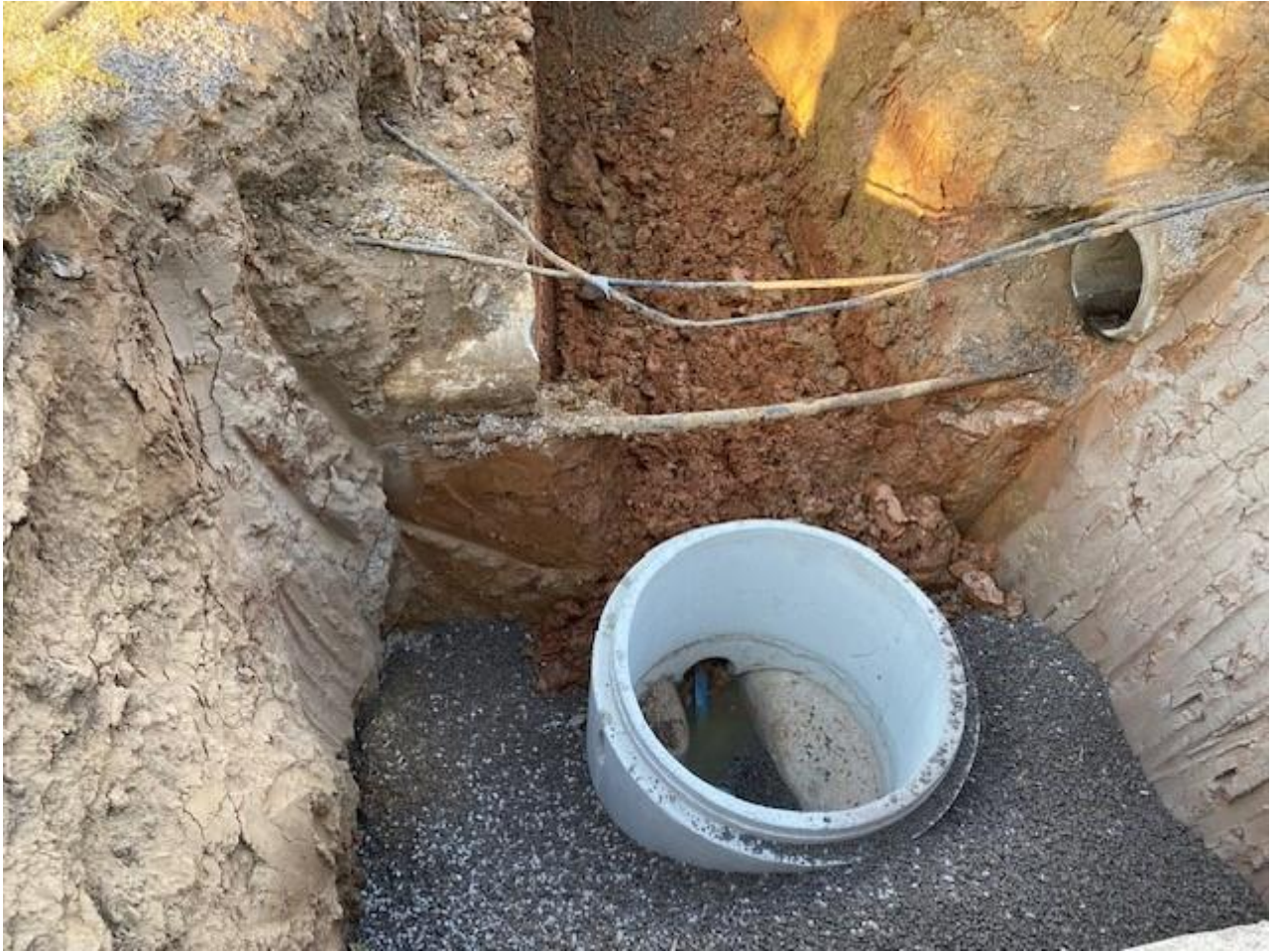
New Manhole Base Set with Initial Backfill