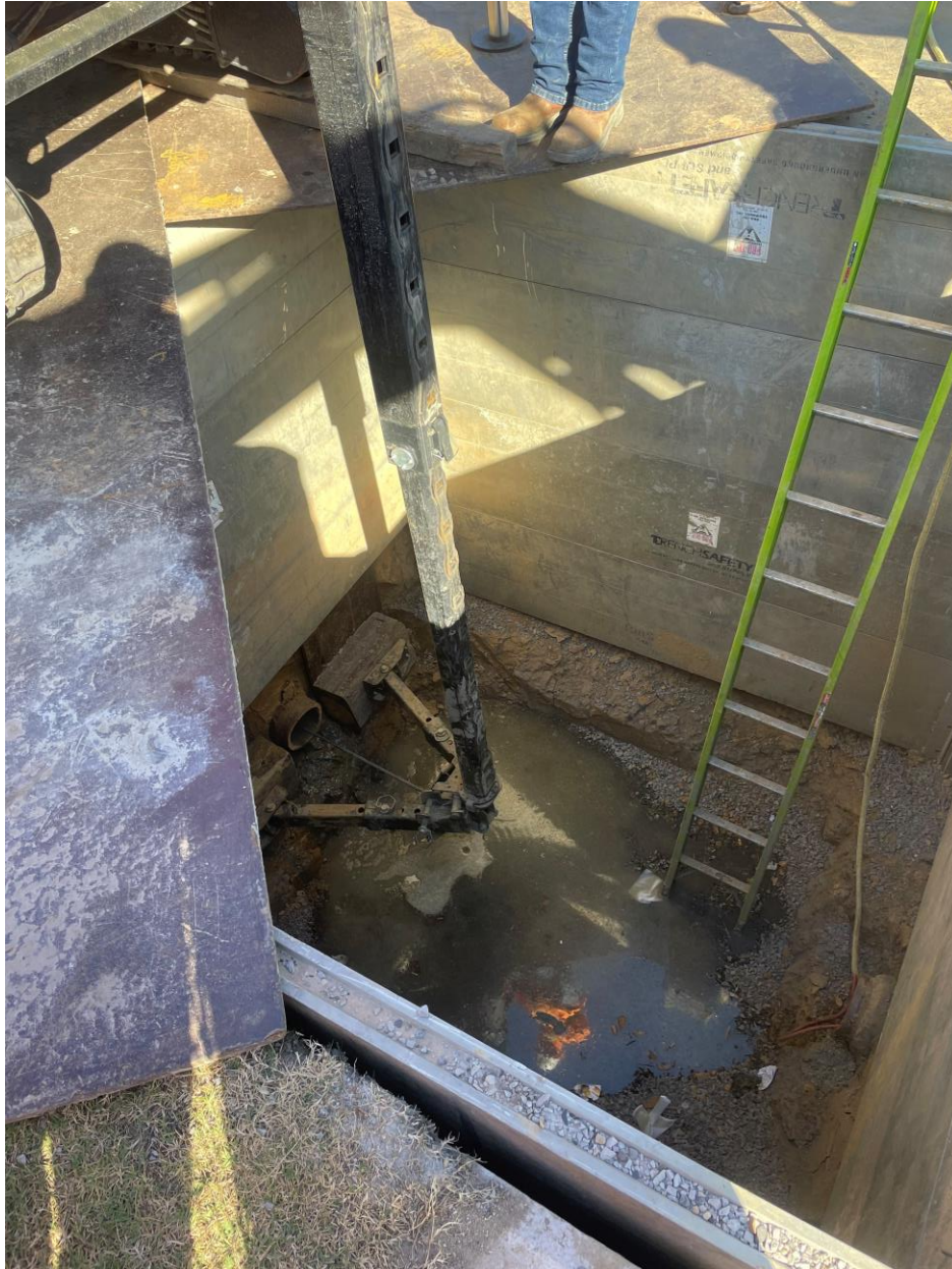
Wench Assembly for Pipe Bursting (This mechanism pulls the “bursting head” through the pipe.)