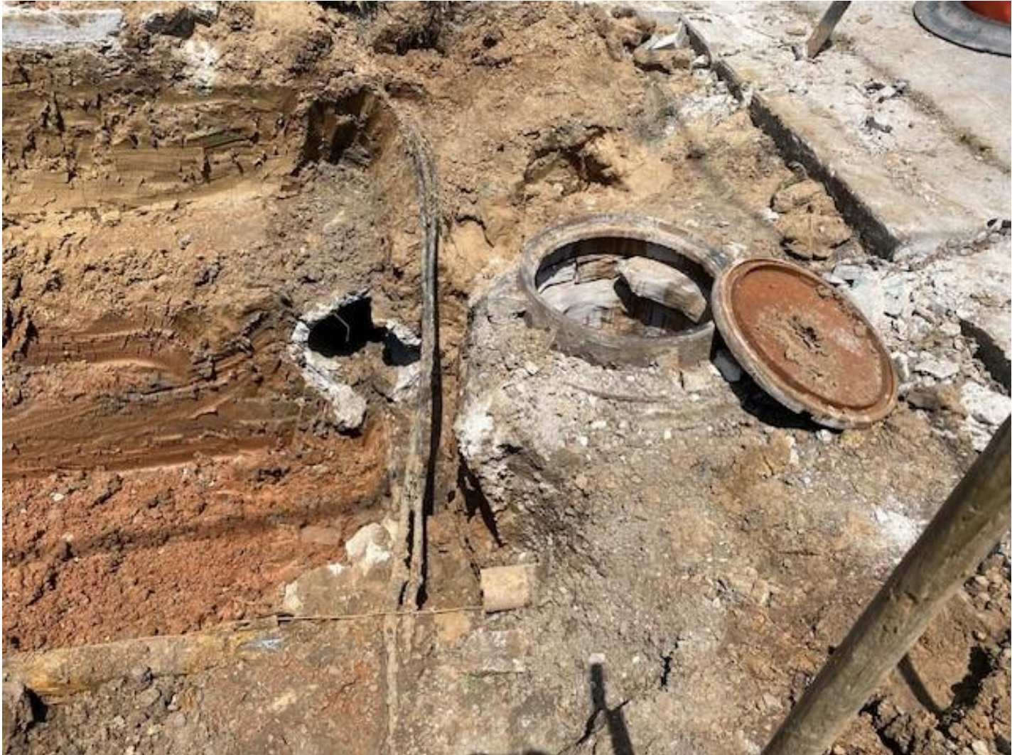
Old Brick Manhole and Nearby Storm Drain