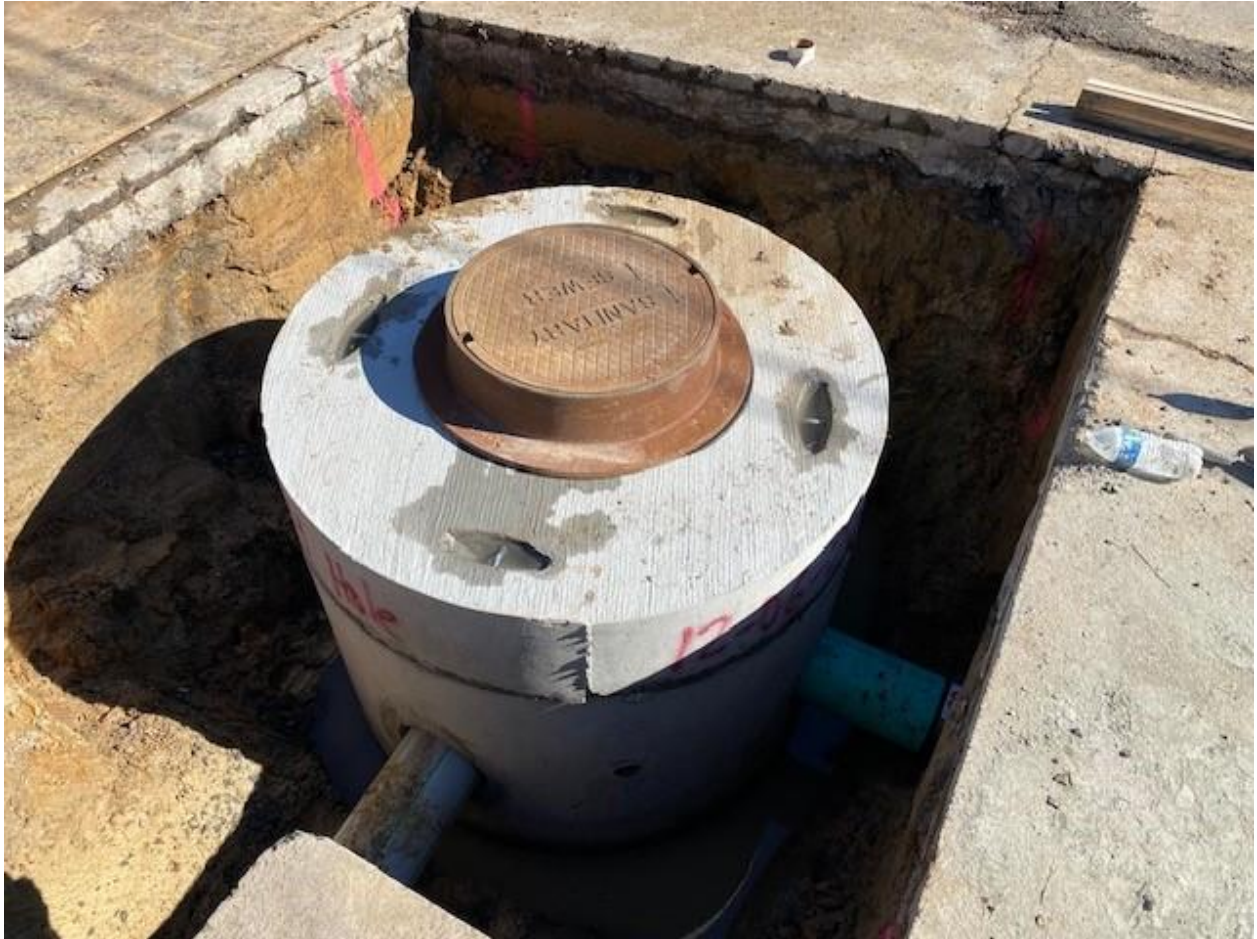
New Flat-top Manhole.