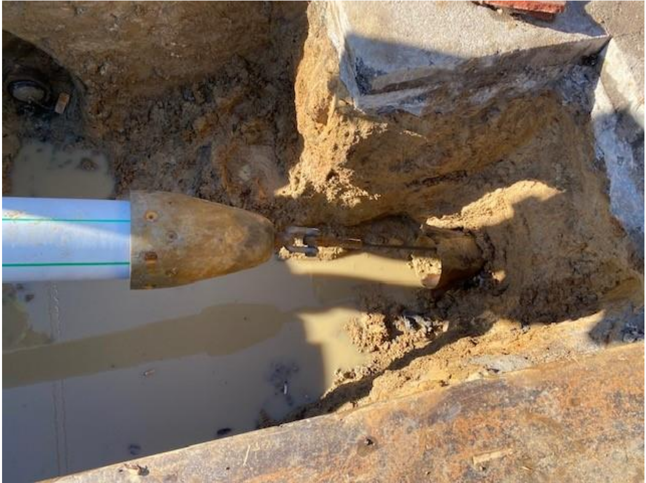
Bursting Head and Wench Line