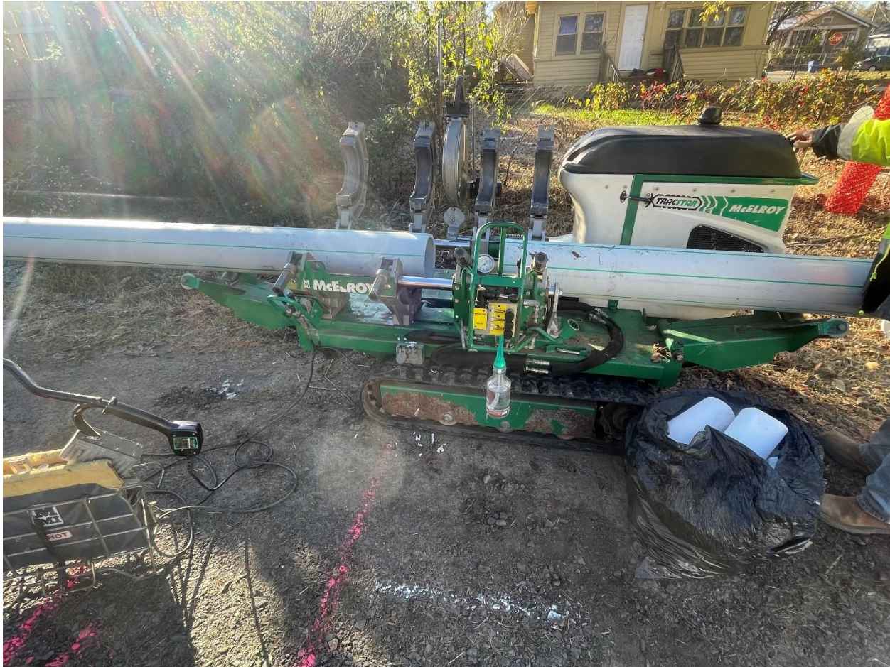
HDPE Pipe Fusion Machine