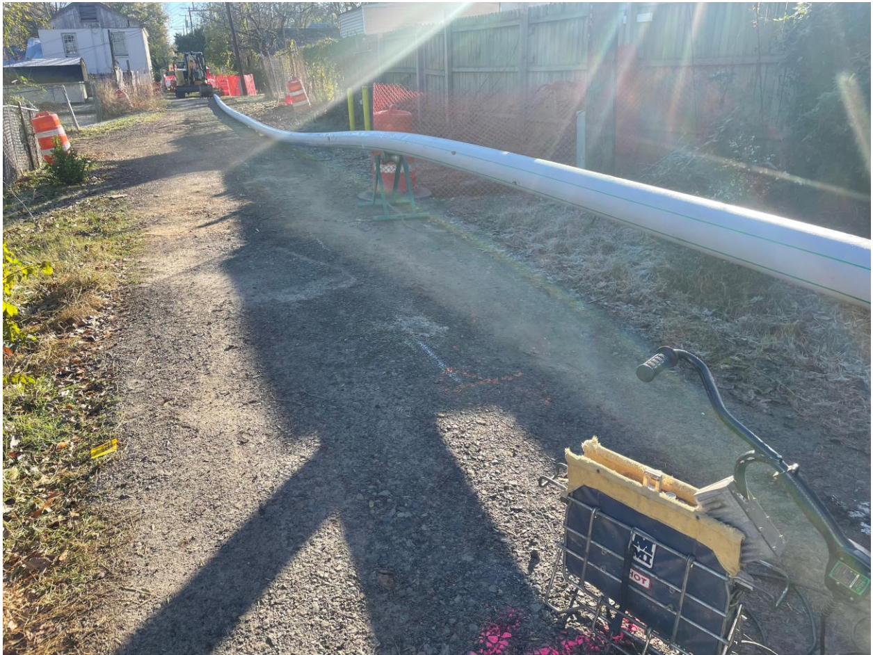
HDPE Pipe (Fused)