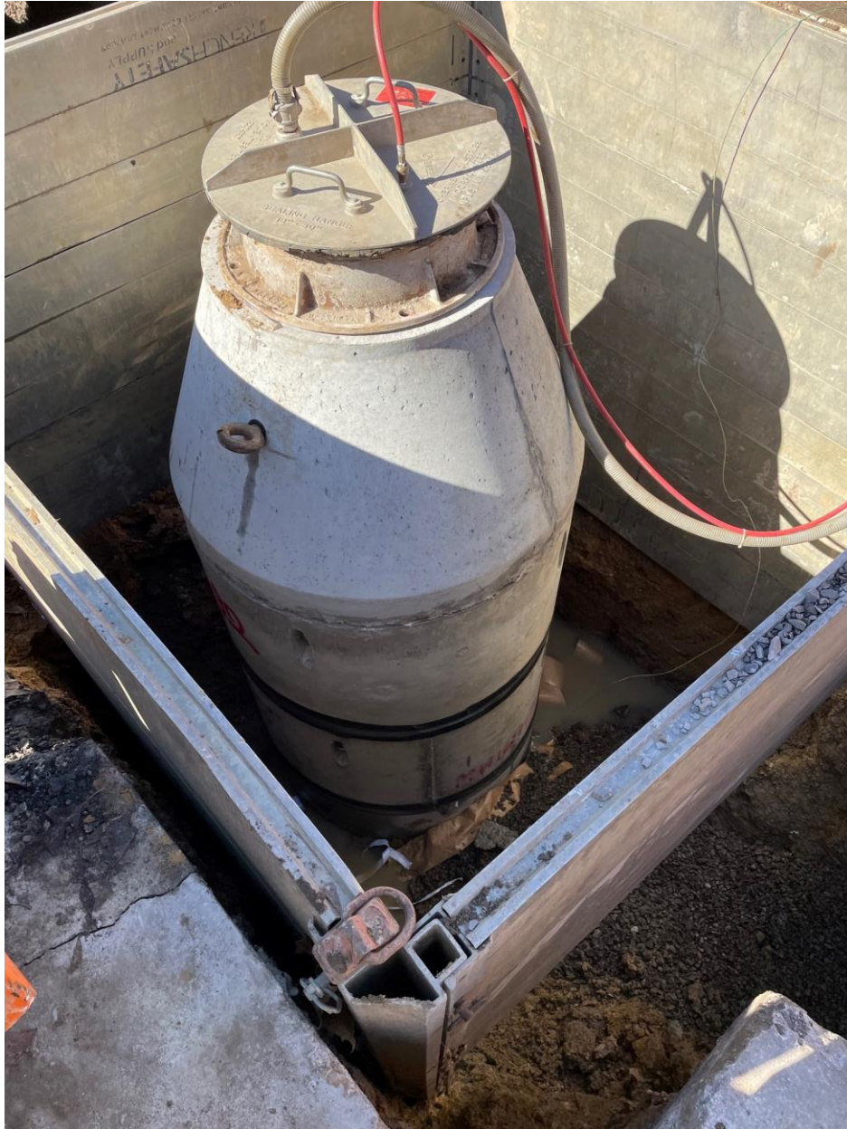
Vacuum Testing a New Manhole (Ensures there are no leaks.)