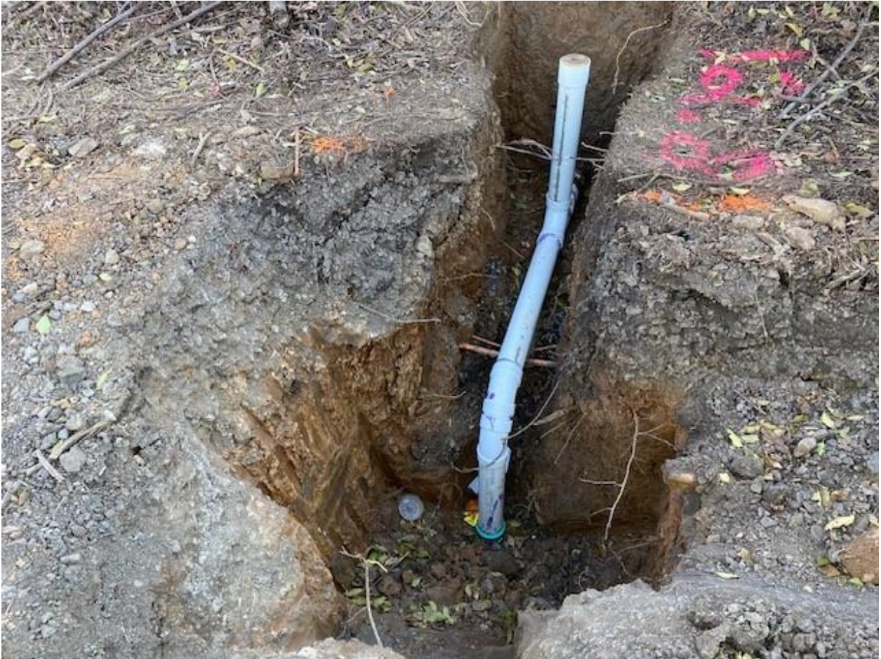
Clean Out Installation (Replaced lateral line and installed clean out.)