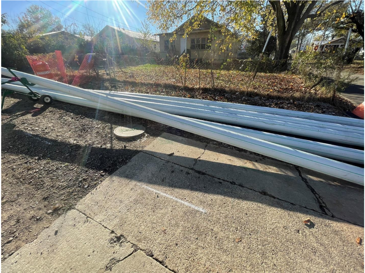
HDPE Pipe Segments (Not Fused)