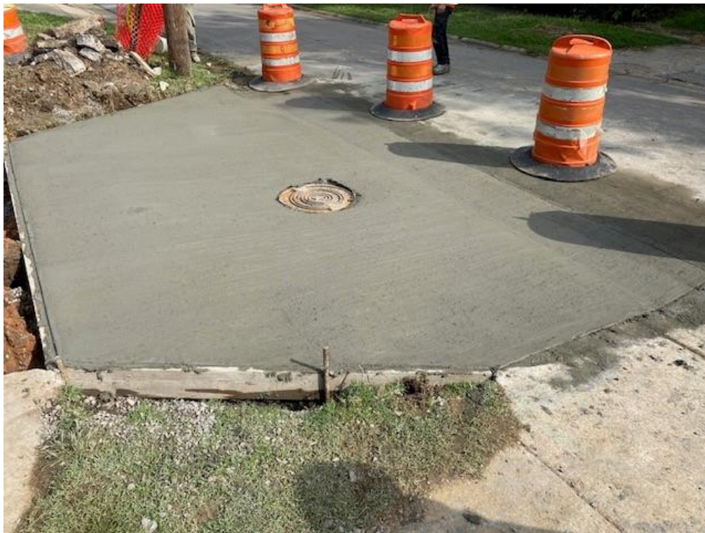
Storm Drain Replacement and Site Restoration