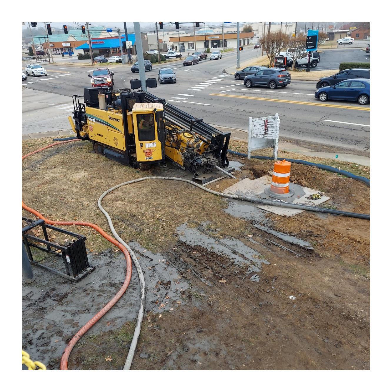
Horizontal Directional Drilling Pilot Hole