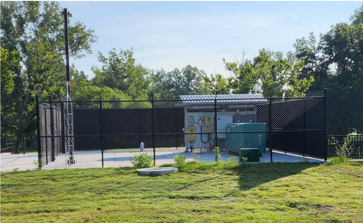
Pump Station 28: Photo taken July 24, 2023