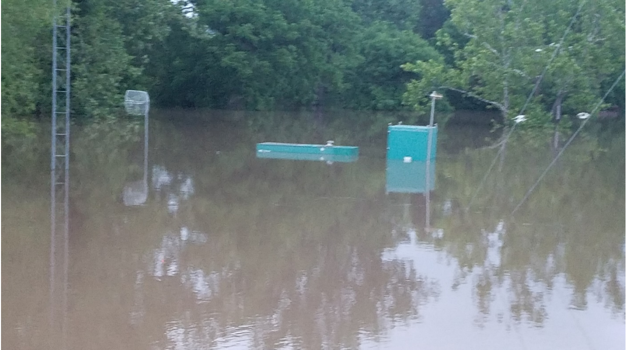
Pump Station 20: Photo taken May 28, 2019