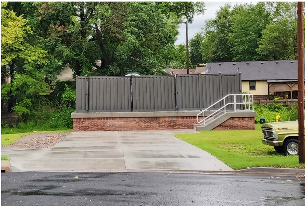
Pump Station 29: Photo taken July 21, 2023