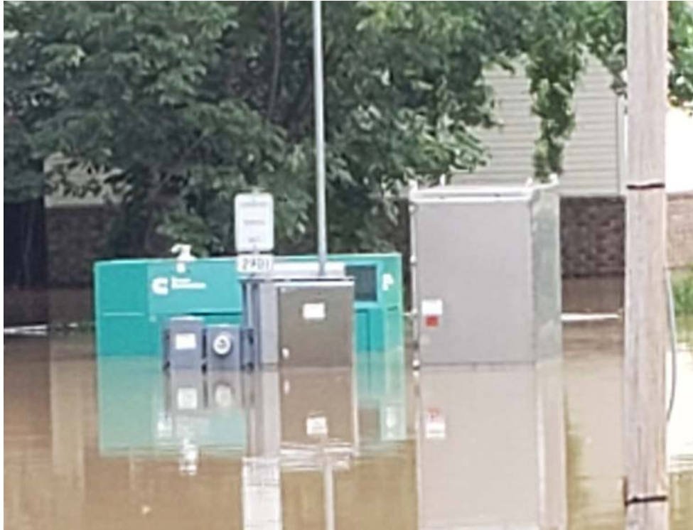
Pump Station 21: Photo taken May 28, 2019