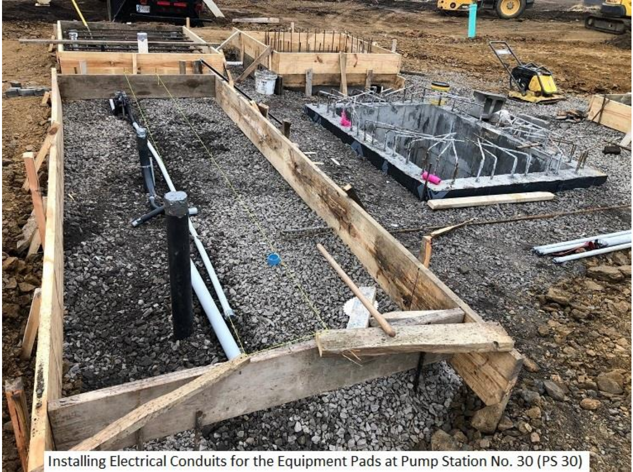
Installing Electrical Conduits for the Equipment Pads at Pump Station No. 30 (PS 30)