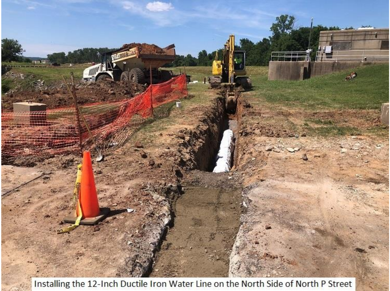
Installing the 12-Inch Ductile Iron Water Line on the North Side of North P Street