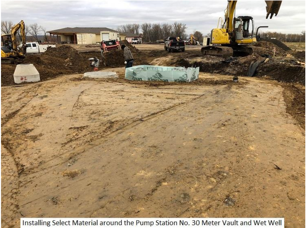
Installing Select Material around the Pump Station No. 30 Meter Vault and Wet Well