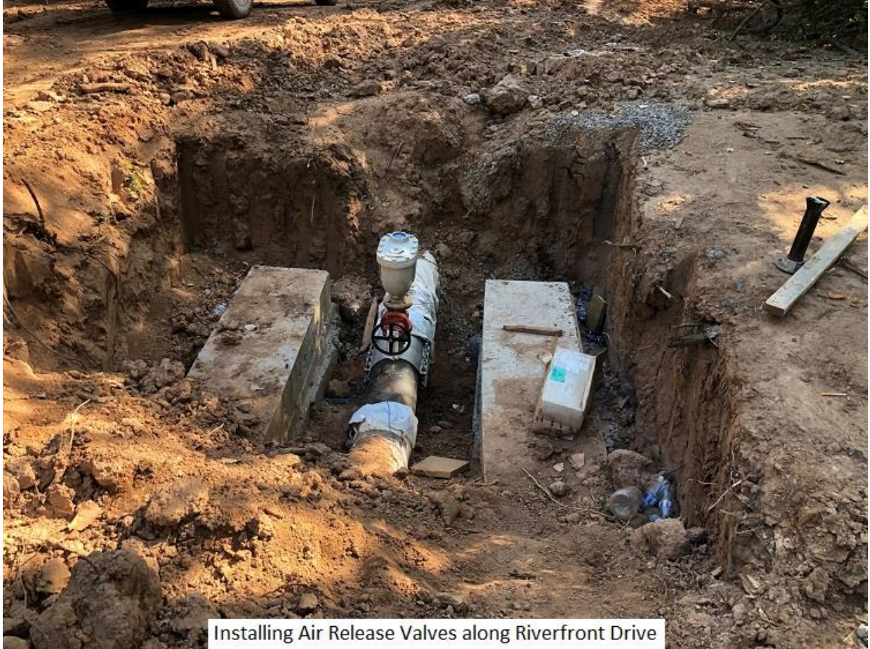
Installing Air Release Valves along Riverfront Drive