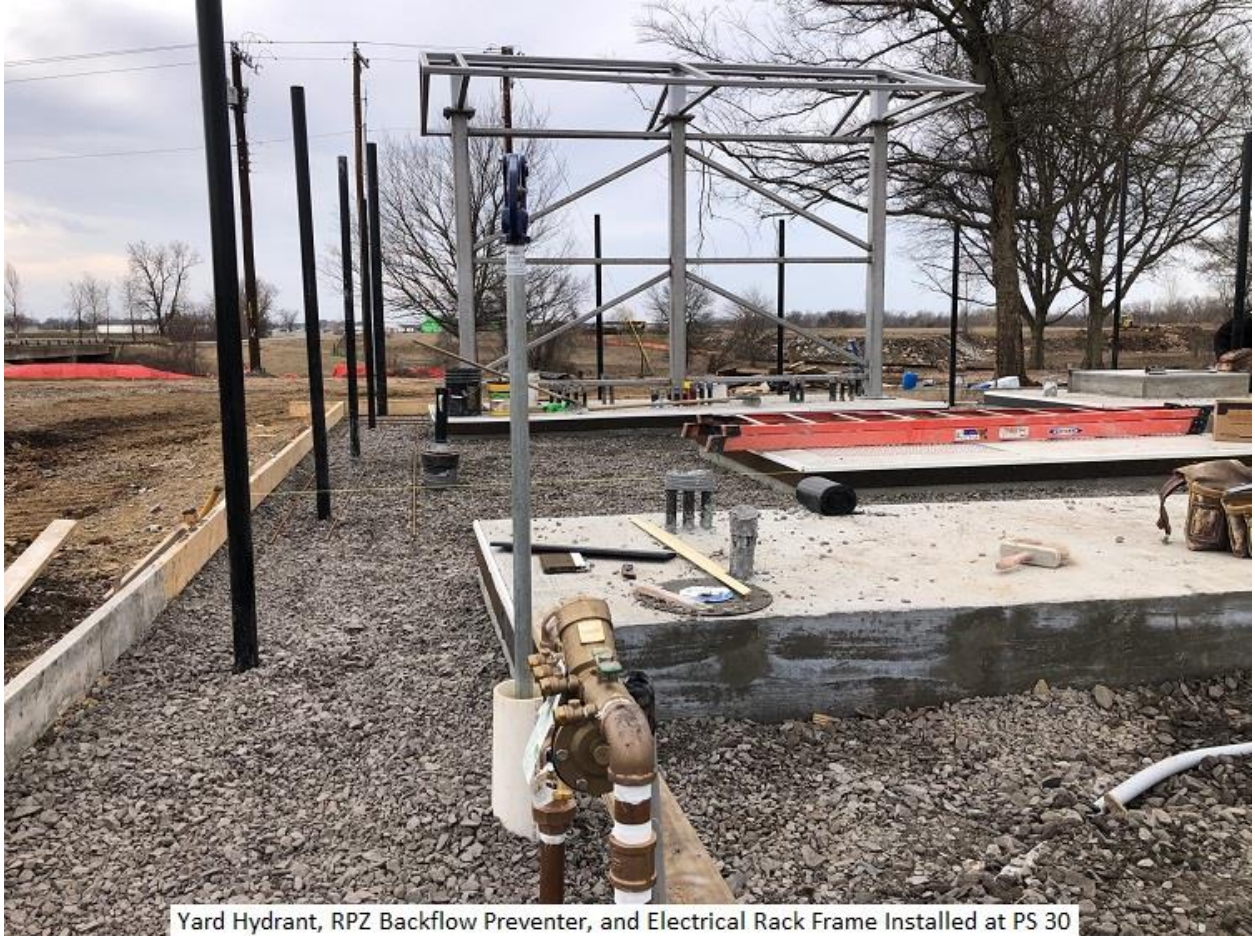
Yard Hydrant, RPZ Backflow Preventer, and Electrical Rack Frame Installed at PS 30