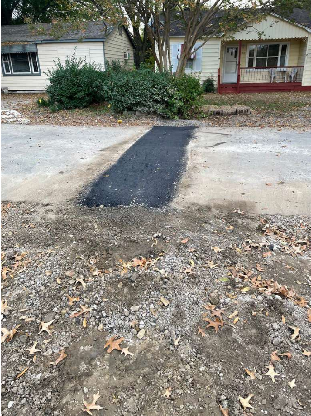
Cross Street Open Cut Patch

(Where The Water Main Is On One Side Of The Street And The Water Meter Is On The Opposite Side Of The Street)