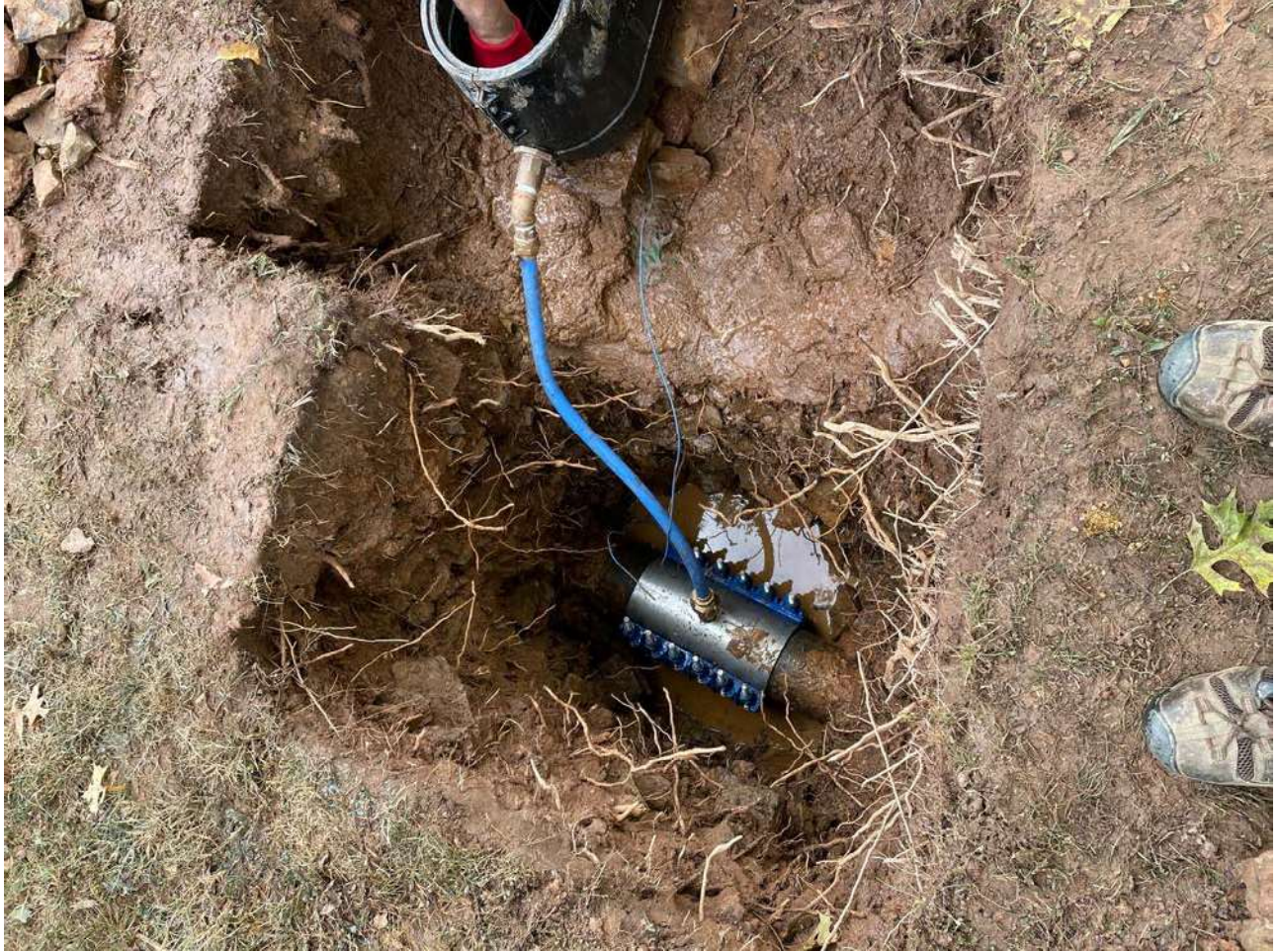
Service Repaired Using A Tapping Repair Clamp