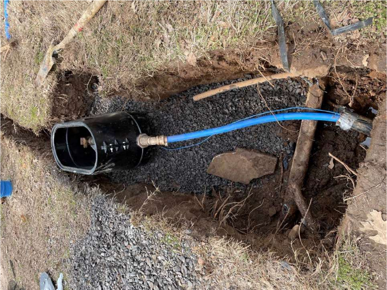
New Service Line And Meter Box