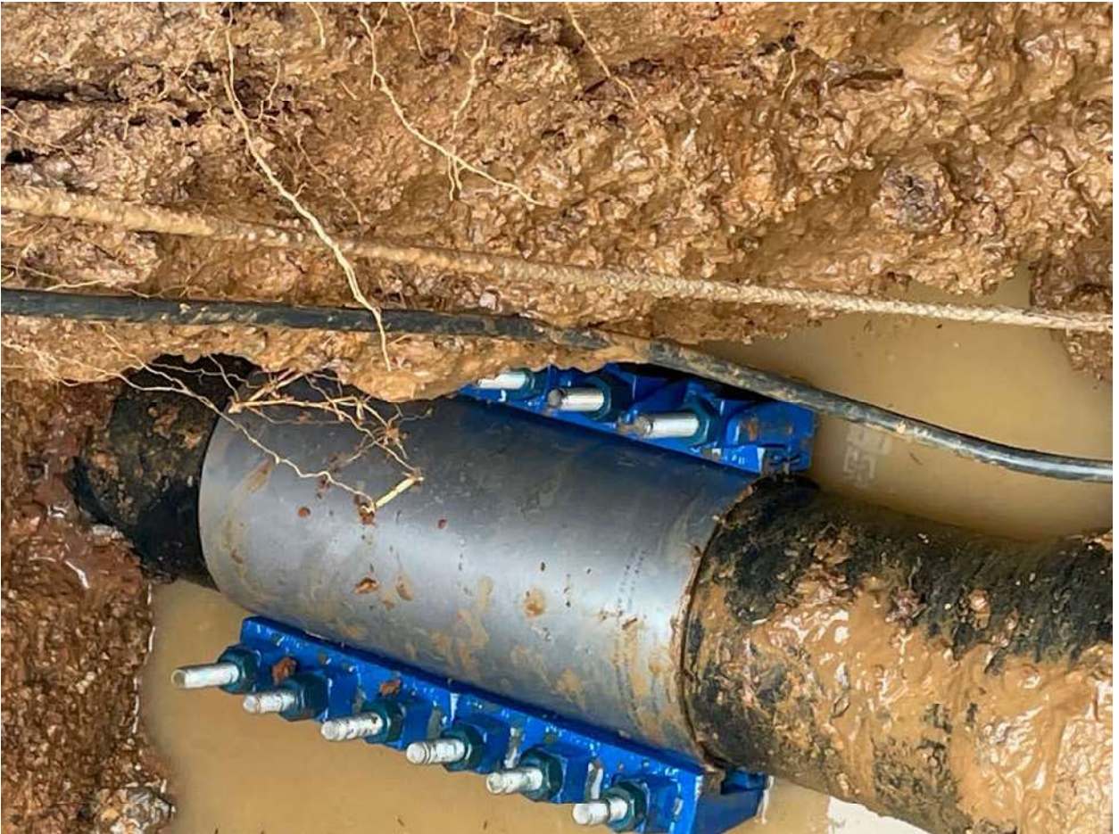
Sealing Leaking Pipe With A Repair Clamp