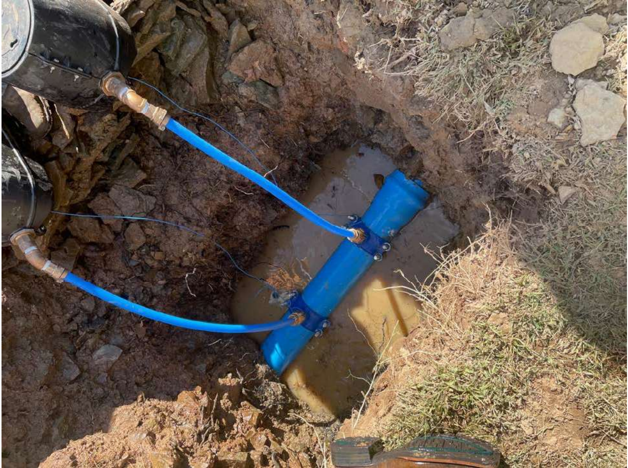
Two Services Repaired Using Tapping Saddles