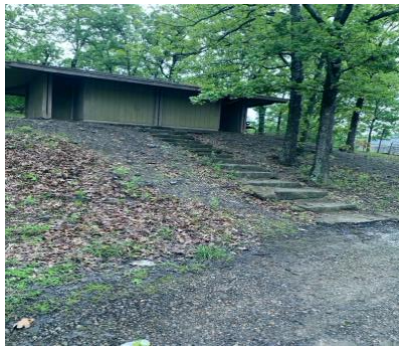
Examples of access points to restrooms and picnic pavilions.

The two restrooms at Carol Ann Cross Park are in desperate need of repair, both structurally and in terms of accessibility. In addition, most of the pavilions are not accessible for individuals with mobility impairments. Improvements to the park will be completed in two phases. The first phase of improvements will address the restrooms and accessibility from the northwest parking area. The restroom located at the southside of the park and on top of a steep hill will be removed, as it cannot be easily accessed by members of the public and is severely dilapidated. An ADA restroom will be installed adjacent to the playground area. The restroom located on the west side of the park will also be removed and replaced with a new, ADA accessible restroom. Furthermore, the parking area on the northwest side of the park will be repaved and an accessible walkway installed to allow citizens of all abilities adequate access to the pavilion and paved walking trail. The next phase of the improvements will involve repaving and expanding the parking area in the southeast corner of the park. An accessible path to the fishing dock and walking trail will also be constructed. As funding allows, inclusion improvements will be made to the playground area and an additional fishing pier will be constructed at the northwest corner of the lake. These improvements will better accommodate the multiple annual fishing derbies held at this location.