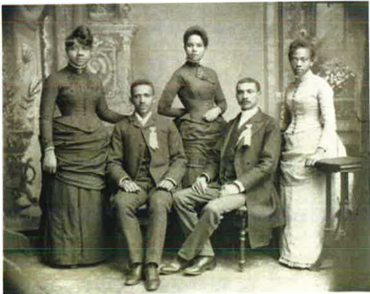
(1888). W. E. B. Du Bois with the Fisk University class of 1888